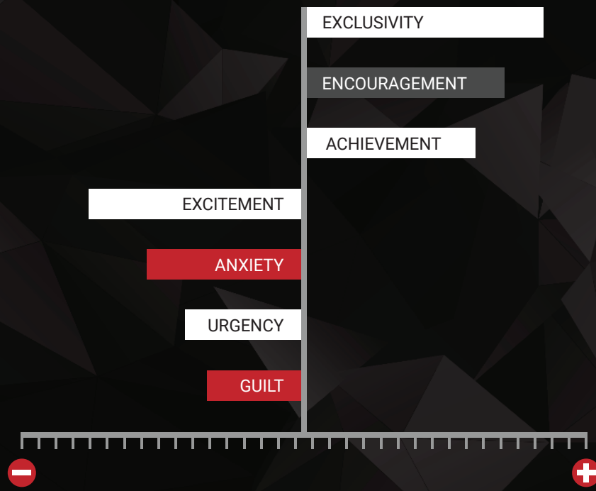
ANALYSIS OF RESPONSE TO EMOTIONAL LANGUAGE