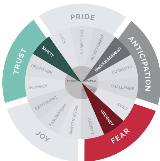
CATEGORIZATION OF EMOTIONS & LANGUAGE